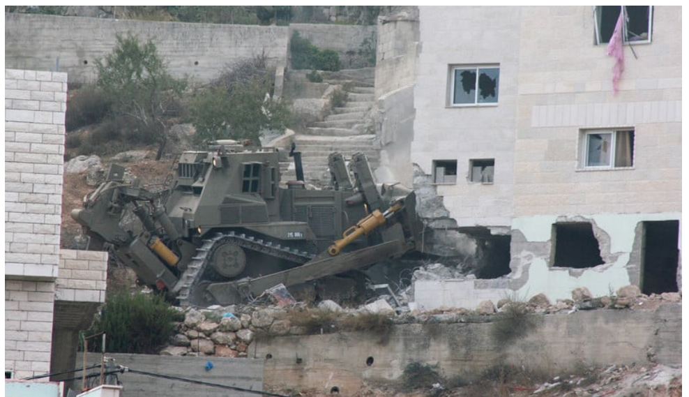
The Israeli colonization of Palestine is visible every day – Israel often bulldozes the homes of Palestinian freedom fighters, leaving the extended family homeless. This photo was taken in 2014.

This accord signed in Oslo, Norway, divided the Palestinian resistance movements. The Palestinian Liberation Organisation (PLO) supported it and others like Hamas opposed it. In 2006, elections were held in Gaza and the West Bank. The PLO won in the West Bank and Hamas won in Gaza.