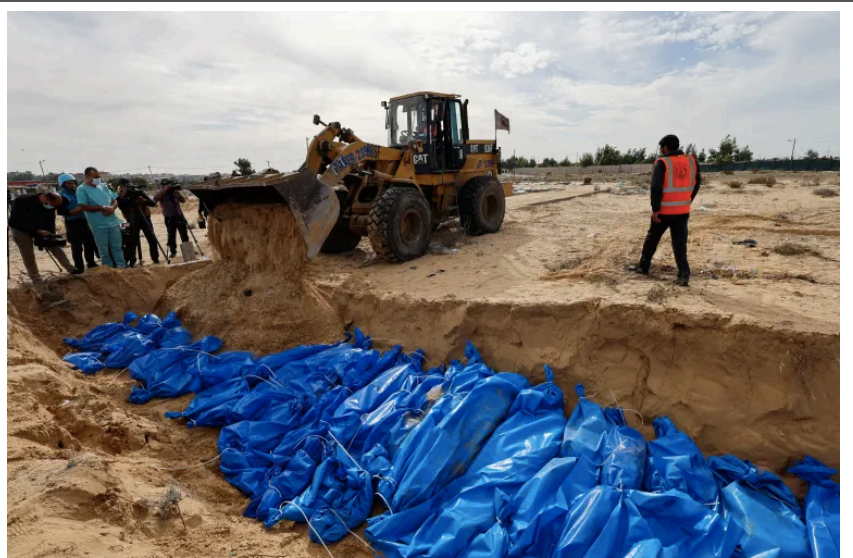
About 100 Palestinians had to be buried in this mass grave without proper funerals on 22 November 2023 after Israel bombed them to death, and the graveyards ran out of space.

Many seem to think that what is happening in Palestine is a fight between Muslims and Jews; others say it is a war between Hamas and the Israeli government; and there are those who are saying that Israeli has the right to defend itself and that Hamas provoked Israel.