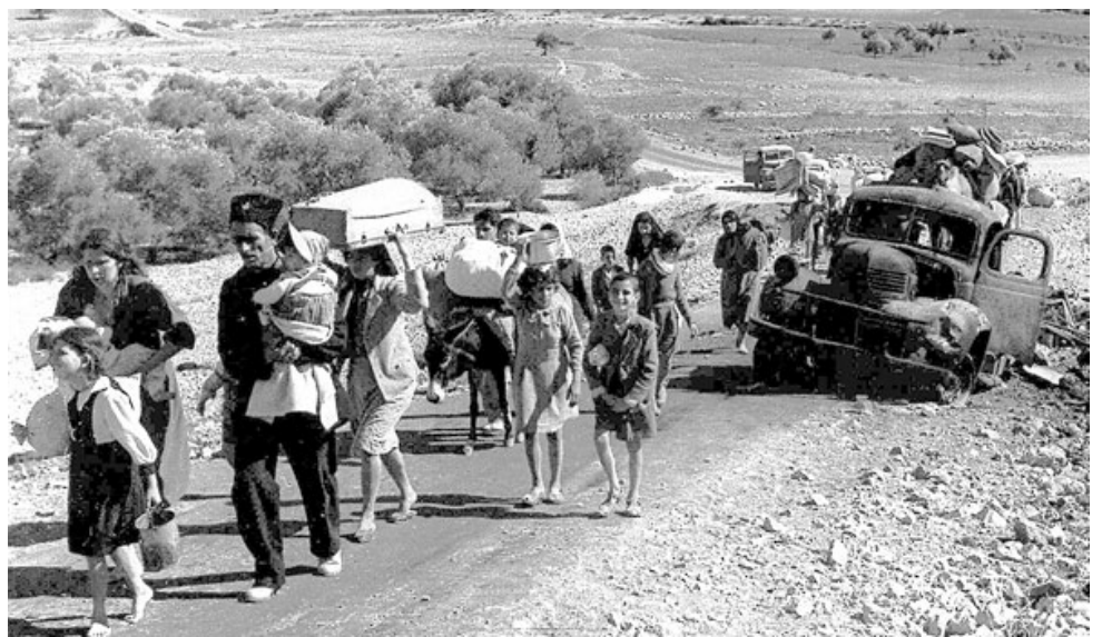
The Palestinian Nakba (catastrophe) of 15 May 1948, when Zionists from Europe carried out a genocide against Palestinians, forcing the Palestinians out of their homes and establishing 'Israel' on stolen Palestinian land.

More than 700 000 Palestinians were evicted from their land and homes, tens of thousands were massacred and more than five hundred Palestinian villages were destroyed. The Palestinians called the genocide of 1948 the “Al Nakba”, the great catastrophe.