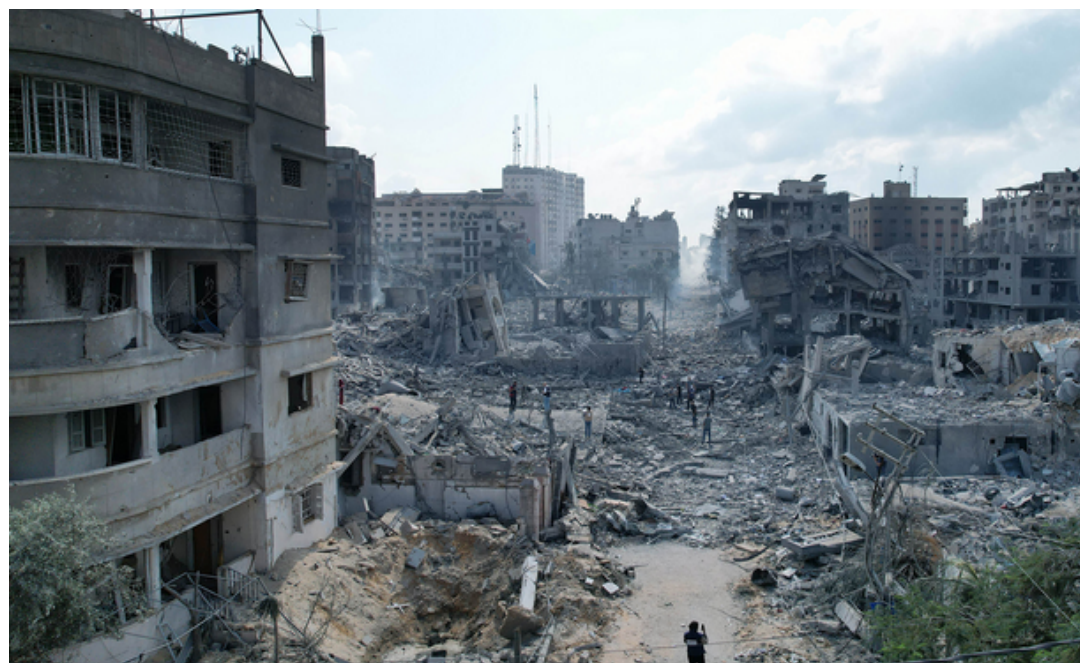
This photo was taken in Gaza on 10 October 2023, just 2 days after Israel began its latest bombardment of the Palestinians. Since then, Israel has bombed 1.5 million Palestinians' homes and killed about 20 000 Palestinians, mostly women and children.

Historically the struggle against apartheid-capitalism in South Africa had important similarities with the liberation struggle of the Palestinians. The Black working class has a shared history of resistance to forced expulsions, evictions, land